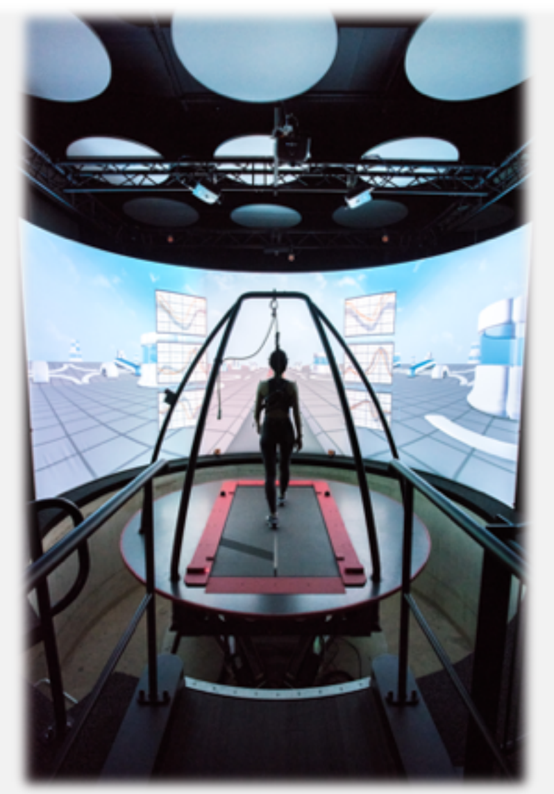
University of Melbourne CAREN Laboratory

Computation modelling for optimizing socket fit